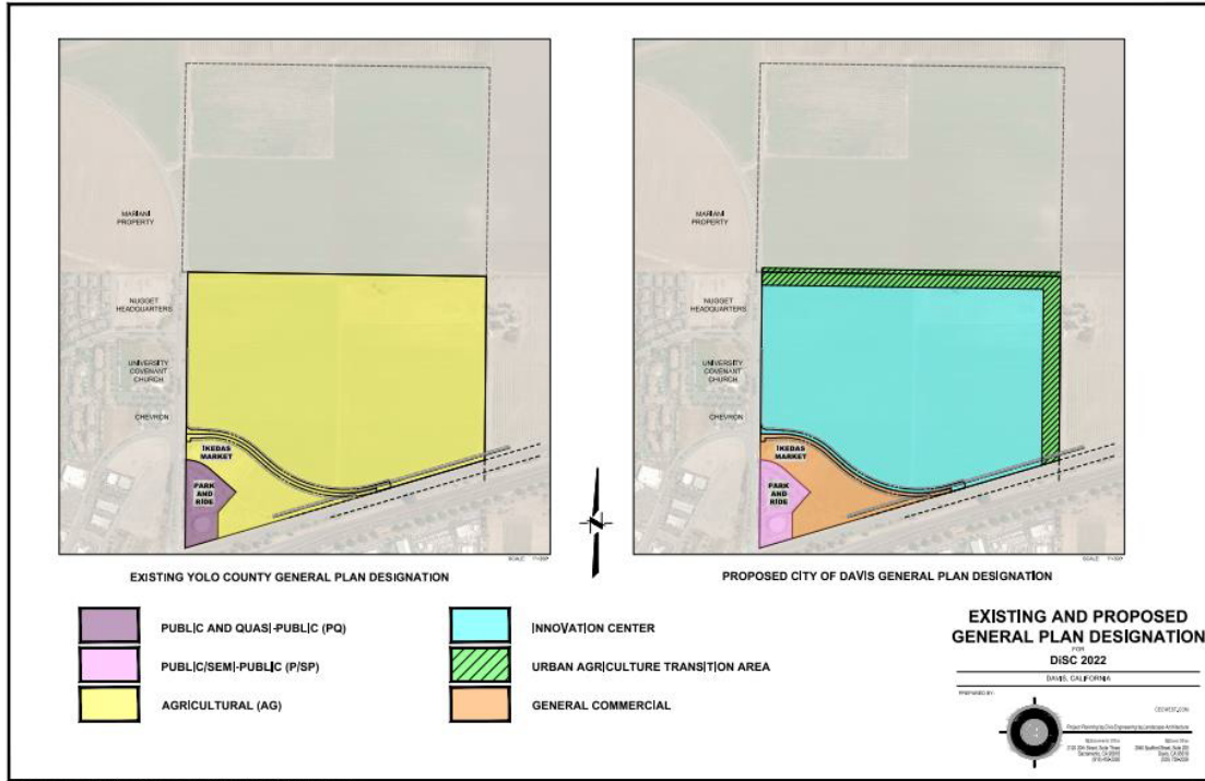
EXHIBIT B LAND USE MAP